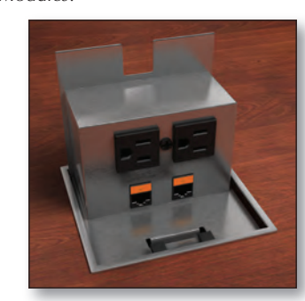
PM3 - Flip-Up Surface Mount Module