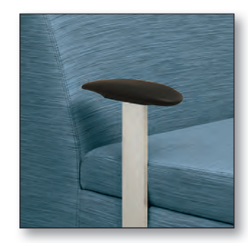
3 - Outside Urethane Task Arm 4 - Inside Urethane Task Arm

Optional arm configurations are designed to allow you to easily outfit each individual seating unit to perform to the fullest. Even with this array of choices, customized solutions are possible. Please contact us with your requirements.