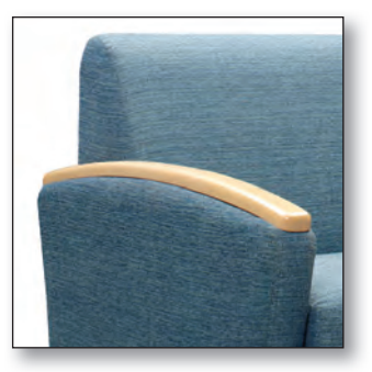
1W - Upholstered Arm with Exposed Wood Arm Cap