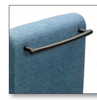
PB - Push Bar