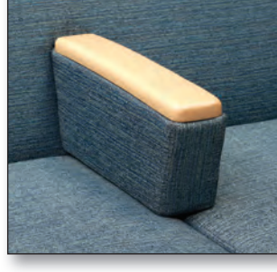
2W - Interim Upholstered Arm with Exposed Wood Arm Cap

Optional arm configurations are designed to allow you to easily outfit each individual seating unit to perform to the fullest. Even with this array of choices, customized solutions are possible. Please contact us with your requirements.