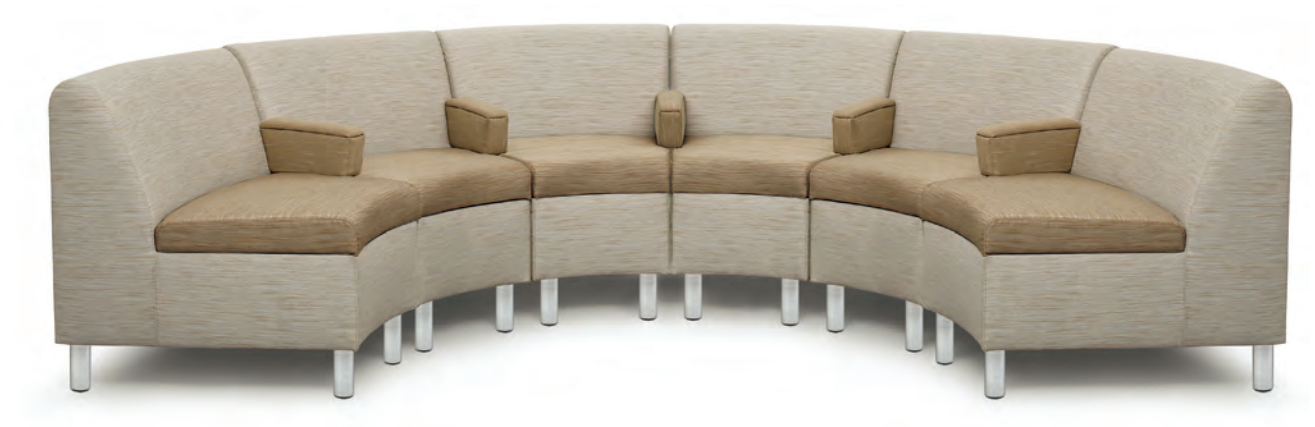
(6) 1576 Inside Wedge - 30° / 30″R