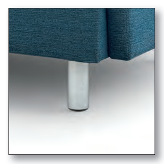
AR - Brushed Aluminum Round Leg (Standard)