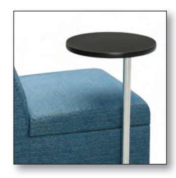
PT - Pole Swivel Tablet Arm