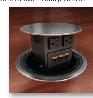
PM2 - Pop-Up Surface Mount Module