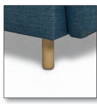
WR - Wood Round Leg