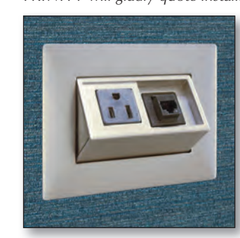
PM1 - Vertical / Horizontal Mount Module