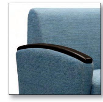
1U - Upholstered Arm with Contrasting Fabric / Vinyl Arm Cap