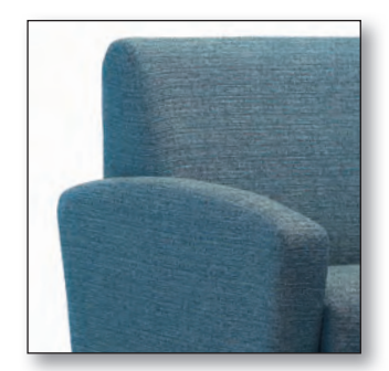
1 - Fully Upholstered Arm