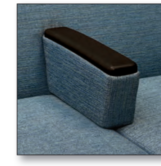
2U - Interim Upholstered Arm with Contrasting Fabric / Vinyl Arm Cap