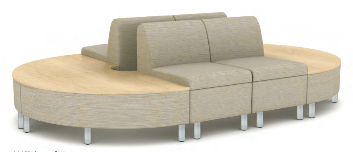
(4) 1571 Lounge Chairs (4) 1590DG6 Table Wedge - 90° / 6″R