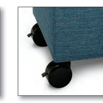
CS - Casters CL - Casters Locking